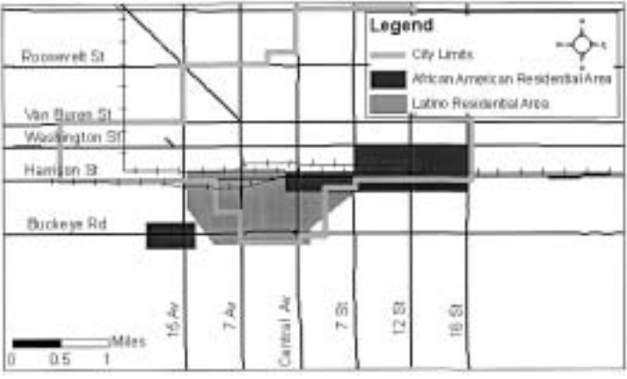
Source: Adapted from Roberts (1973) Figure 2. Minority Neighborhoods in Phoenix, 1911.

By the late 19th century, Mexicans and Mexican-Americans were the largest 'minority group' in Phoenix (Table 1), joined by smaller populations of African Americans, Chinese, and American Indians (U.S. Census of Population 1900, 1950, 2000). While all racial/ethnic minorities were the subjects of discriminatory discourses and practices, those directed at Latinos and Blacks had the most persistent effects on land use and place construction in the city. Residential segregation and unregulated land uses in minority districts began shaping social and environmental conditions in what would become South Phoenix by the 1890s, when Phoenix's population numbered fewer than 5,000 people. Even at this early stage in the development of the city, the dividing line between Anglo Phoenix and the southern subaltern district was beginning to be established, demarcated by an east-west rail corridor first established in 1887 (Myrick 1980). This corridor soon began serving as both the physical and symbolic boundary between two developing urban worlds (Figure 2).