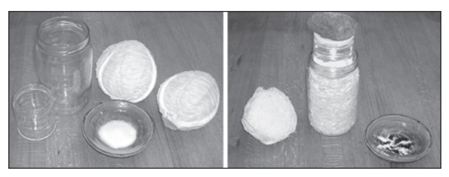
Figure 2. The components of lactic acid fermentation (sauerkraut): vegetable (cabbage), non-iodized salt, weight, and time.

Another way to explore the concept of ecological succession is to make cheese. Dairy fermentations involve the conversion of lactose to lactic acid through several successional phases. Raw milk, after it is collected, contains multiple bacterial populations. Fresh milk has a neutral pH and a warm temperature — perfect conditions for the rapid multiplication of Lactococcus bacteria. Lactococcus immediately begins producing lactic acid, lowering pH, and thus creating favorable conditions for the growth of Lactobacillus bacteria, which convert lactose to lactic acid and lower the pH further