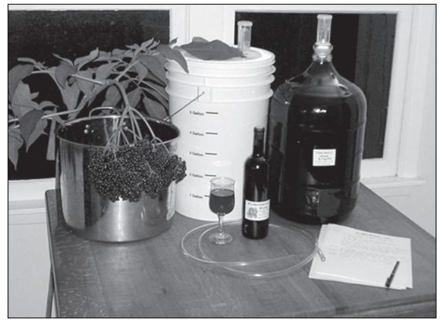
Figure 3. The components of wine fermentation: fruit (elderberry), pot, bucket, carboy, siphon tube, and airlocks to allow carbon dioxide to escape from the containers.

by fermenting sugary fruit juices. Species of Saccharomyces are ambient in the environment, and are present on the skins of fruits such as ripe grapes (Holloway et al. 1990). Old world grape wines were products of the native yeasts in their regional ecosystems. Modern oenology has shown that there is a succession of fermenting microorganisms, that yeast strain populations differ between batches and years, and wine quality is therefore vineyard and vintage dependent (Schutz and Gafner 1994). The wine yeasts can out-compete the pathogenic onslaught introduced during barefoot stomping without pasteurization, and produce a 12% alcohol (and thus pathogen-free) wine for the table. Domesticated Saccaromyces (store-bought wine yeast, brewers yeast, or bread yeast) combined with different ingredients and environmental conditions, can be manipulated using simple equipment (see Figure 3) in a pedagogical setting to demonstrate environmental chemistry, population dynamics, nutrient limitation, and competition for finite resources.